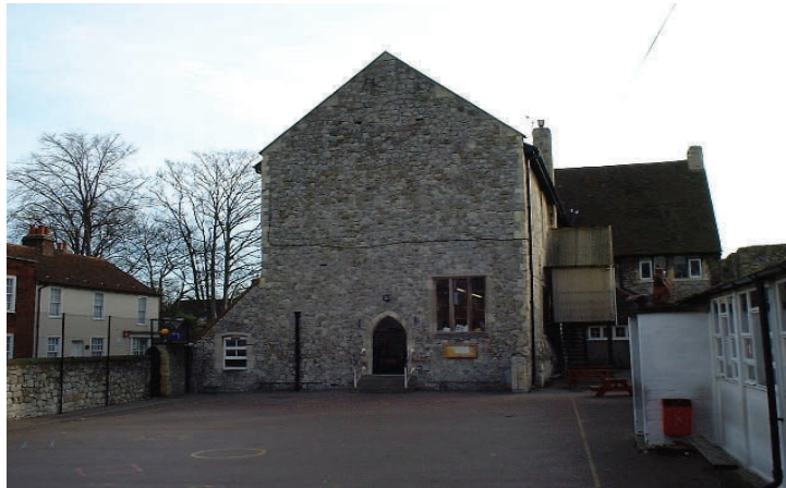
Diocesan & Payne Smith CE Primary School

The suggested timetable for either a competition or exemption from competition can be found on the following pages.