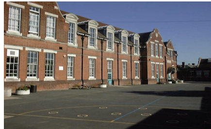
Kingsmead Primary School

Kent County Council would like to hear your views on a proposal to amalgamate Kingsmead Primary School and Diocesan & Payne Smith CE Primary School with effect from 1st September 2012.