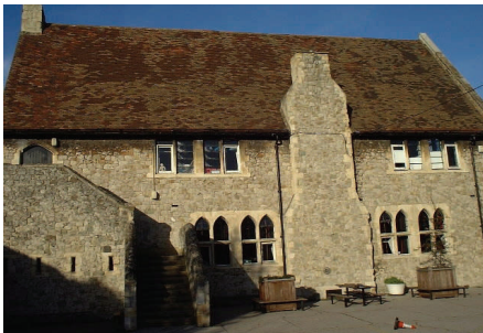
Diocesan & Payne Smith Church of England Primary School