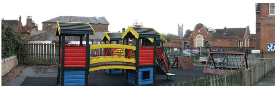
Kingsmead Primary School Play Area